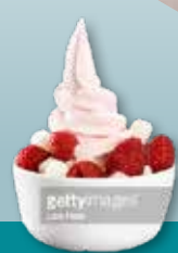
MIX-INS & TOPPINGS