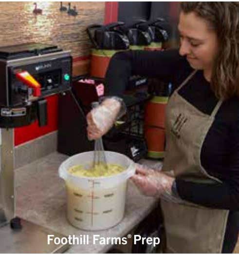
Foothill Farms® Prep