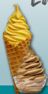
CUP OR CONE